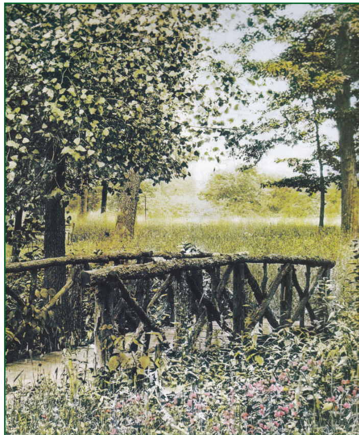
1911 hand-colored, glass lantern slide view of southeast portion, Middle Campus of Lake Forest College, labeled “Our Botanical Garden.” This reflects a 1892 campus plan by O.C. Simonds and an 1897 campus plan by Warren Manning, Boston, both landscape architects who founded the American Society of Landscape Architects, 1899. Archives, Lake Forest College library.

ings on whether the Ring Road should be retained and if so, what characteristics it should have (curbs or no curbs, drainage, width, surface materials). The Committee has done a preliminary analysis of the bluff’s stability. The Committee is reviewing the condition of the existing concrete stairs as well as the wood ramps and stairs to the beach.